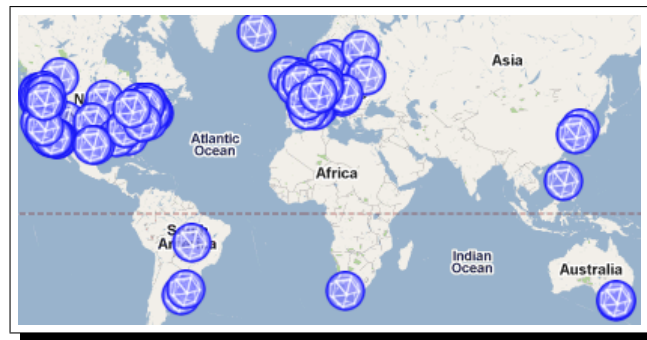
There are Sage developers on every continent: http://www.sagemath.org/development-map.html

In summary, Sage Days have been wildly successful, helping to grow the Sage developer community so that it is now the world’s largest and most diverse open source mathematical software development effort.